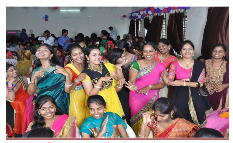
Students enjoying the event