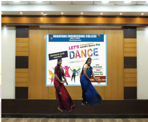
Dance Performances by students